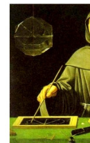
Luca Pacioli, the father

Franciscan Father of Accou described doubl statements and